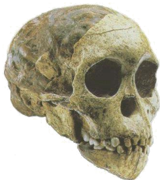
"The Taung Child" Australopithecus africanus